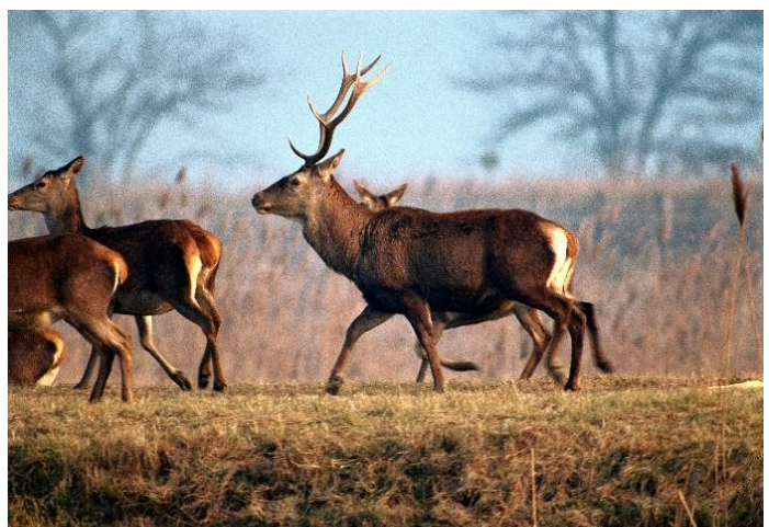
Bosco della Mesola

Then, there will be the " Bosco della Mesola " where, one part of the wood is a Full Nature Reserve, an area fully protected and left to its natural evolution, while the rest of the area is a Nature Reserve. The terrain is of alluvial origin and is irregular, a symptom of ancient dunes which in parts form pools of water with marsh vegetation. At one time, the wood, being surrounded by marshes, was frequented by numerous bird species typical of the wetlands; the drastic reduction in fauna, caused by the drainage works, has been halted by the creation of a wetland area inside the wood, called Elciola, generally closed to the public, where duck species and herons find sanctuary. The mammals present in the Mesola Woods Nature Reserve are mainly fallow deer and a large nucleus (about 300) of "Mesola deer", the last nucleus of the ancient deer of the Po Valley.