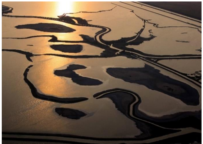
Valli di Comacchio

The " Valli di Comacchio ", marshes which are still one of the largest lagoon systems in Italy. They cover an area of more than 11,000 hectares between Comacchio and the river Reno and are connected to the sea via canals. They form an environment of rare beauty within the Po Delta Park: in some places the stretches of brackish water are interrupted by rises in the land or divided by embankments and ancient sandbars, in others they extend freely like mirrors reflecting the ever-changing light of the sky. Here participants will be at the Bettolino di Foce, a restaurant set within an ancient 'fishing hut' in the Comacchio Lagoons.