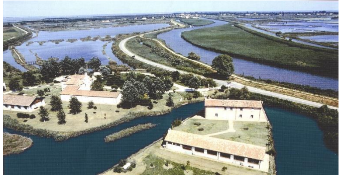
Oasi di Canneviè

First will be the " Oasi di Canneviè ". It is generally quite shallow, and the prevalent vegetation includes underwater plants and bed of rushes. A small number of purple herons, little bittern and great reed warblers nest here. The migratory birds are much more numerous, counting mainly ducks. The fish include grey mullets and eels. Particularly characteristic of the area are the fishing house of Porticino and the old fishing station at Canneviè, recently restored and currently being used as accommodation and restaurant.